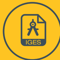
Compare against CAD